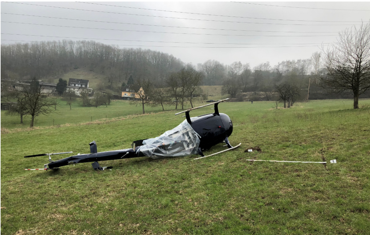
Accident site overview: Power line, downward slope, ground traces, and damages

The helicopter touched down hard at a downward sloping meadow south-west of Bisholder in the vicinity of an overhead power line. Up until the helicopter rolled over the engine was running with decreased power.