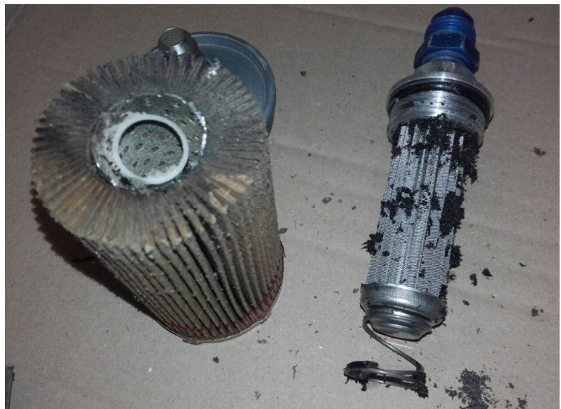
Missing stop bolt at the throttle and contaminated fuel filter