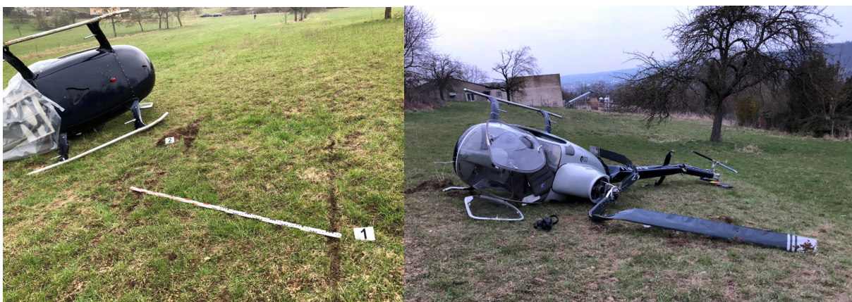
Accident site and helicopter damages