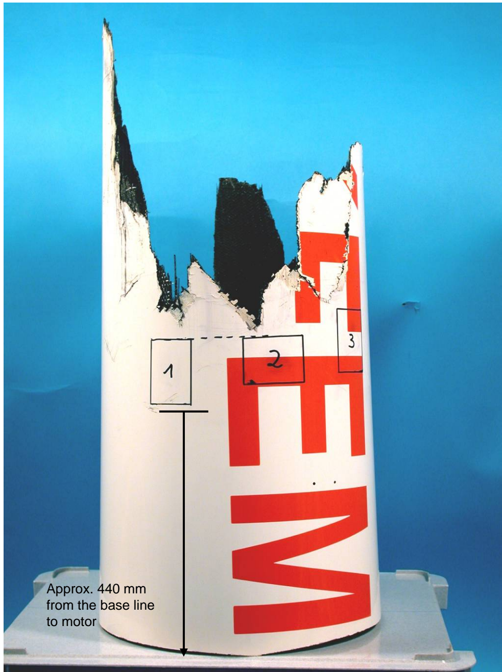
The fractured section of the rear fuselage with three of the four quadrants marked (Number four is on the upper side).