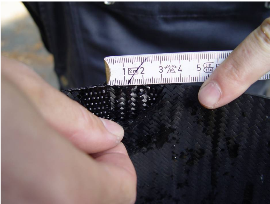
Left Fuselage half: Approx. 20 mm gap in the unidirectional layer UD-Layer