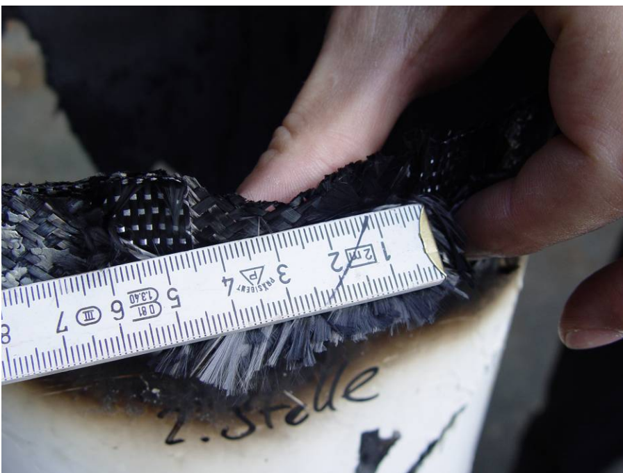
Right Fuselage Half: Approx. 45 mm gap in the unidirectional layer