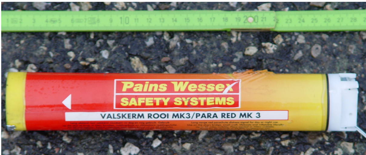
Pyrotechnical device with classification and description