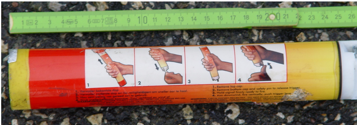
Handheld flare with imprinted operating instructions and warnings