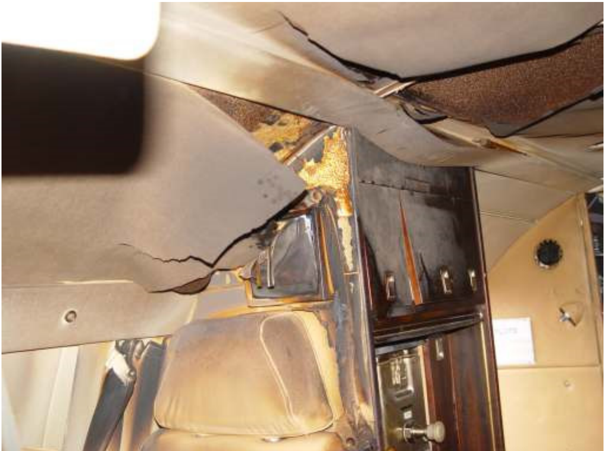
Traces in the cabin; line of vision is flight direction