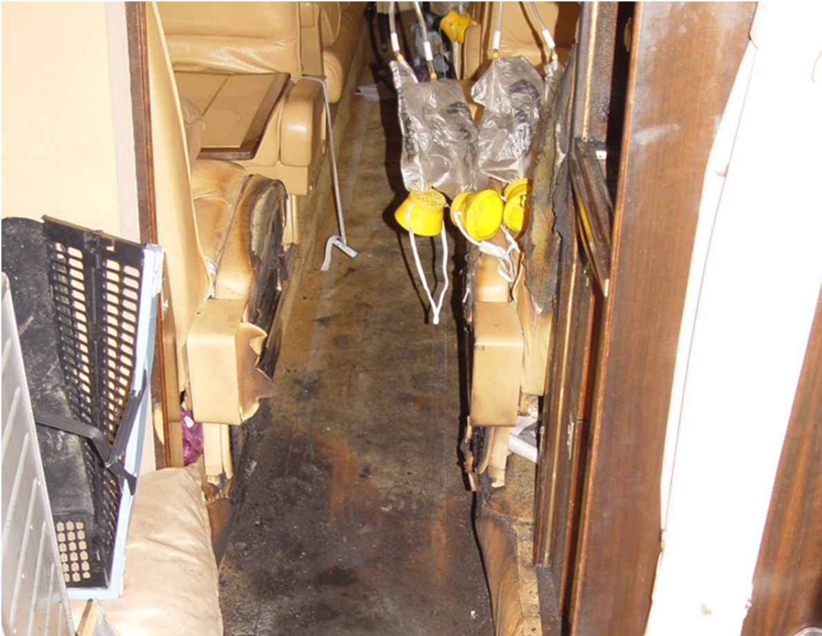
Fire damage on the cabin floor opposite the galley