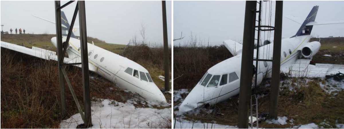
Locked emergency exits

The airbrakes on both wings were in the extended position.