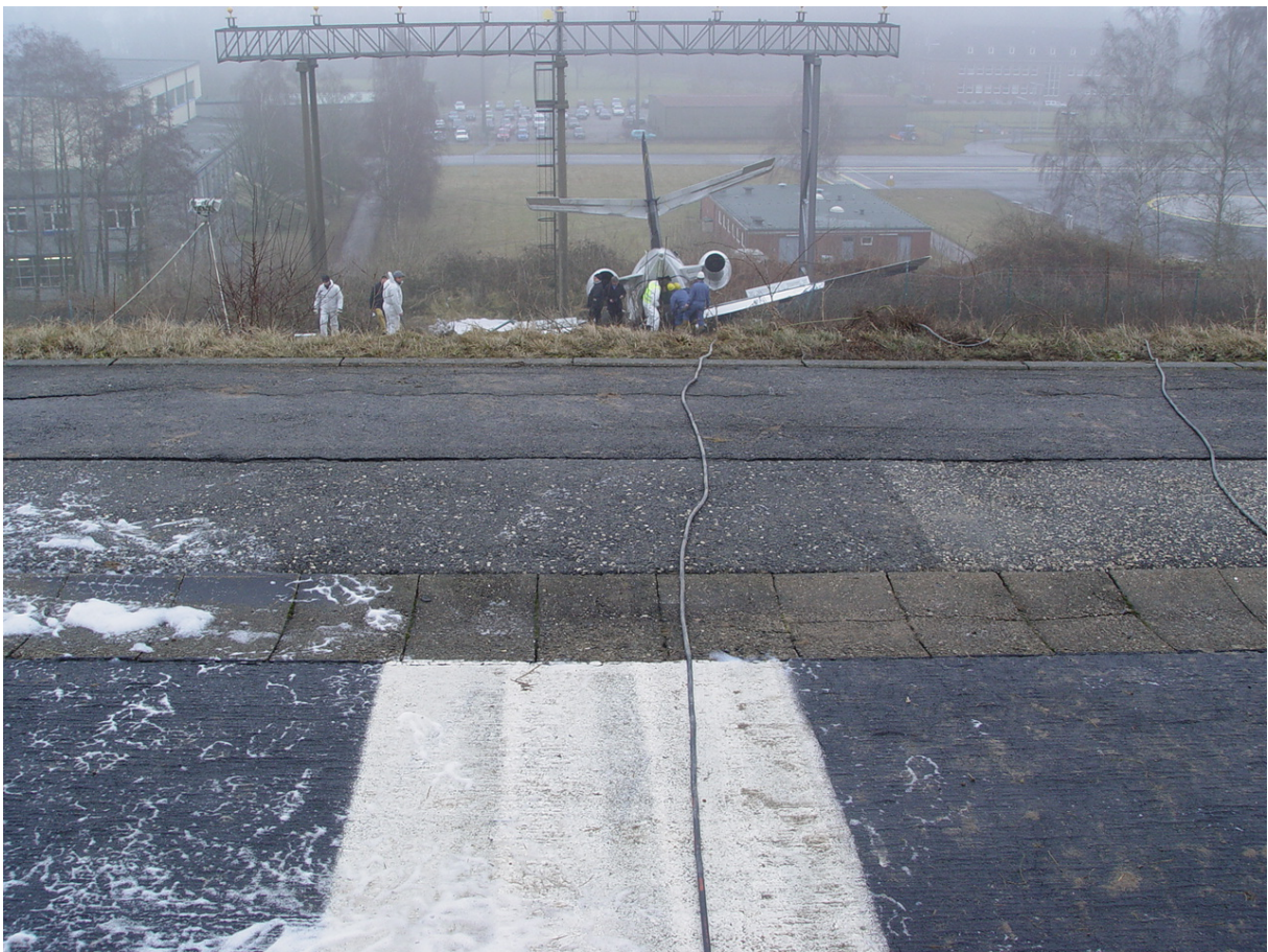
Final position of the airplane

The airplane had overshoot the end of runway 08. In the process it had destroyed a concrete lamp post in the adjacent sloping ground, had burst through the airport fence and had come to rest about 30 m behind the asphalt area, about 140 m behind the threshold of runway 26 in extension of the centre line and about 5 m below the airport level. The distance between the threshold of runway 08 and the final resting point of the airplane was about 1,174 m.