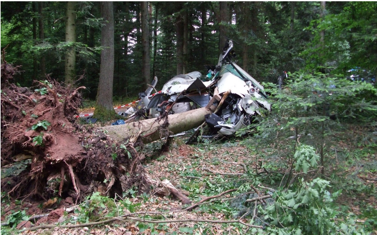
Main wreckage position with uprooted tree

The accident site was located north of Engelsbrand in a forest on a hill. The main wreckage lay on its right fuselage side and pointed toward the south opposite to the direction of the flight. An uprooted tree rose from the cabin. From about the crown down to the final resting place of the wreckage tree limbs and bark had been scraped off the tree trunk. There was an additional tree south of the wreckage whose crown had been severed.