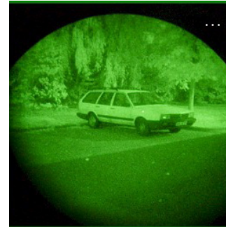
NVG mounted to a pilot's helmet, components and an example image