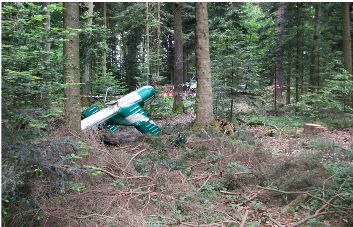
View from the direction of flight at the point of initial tree contact.