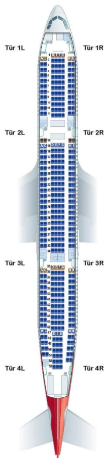
Cabin Layout Airbus A330