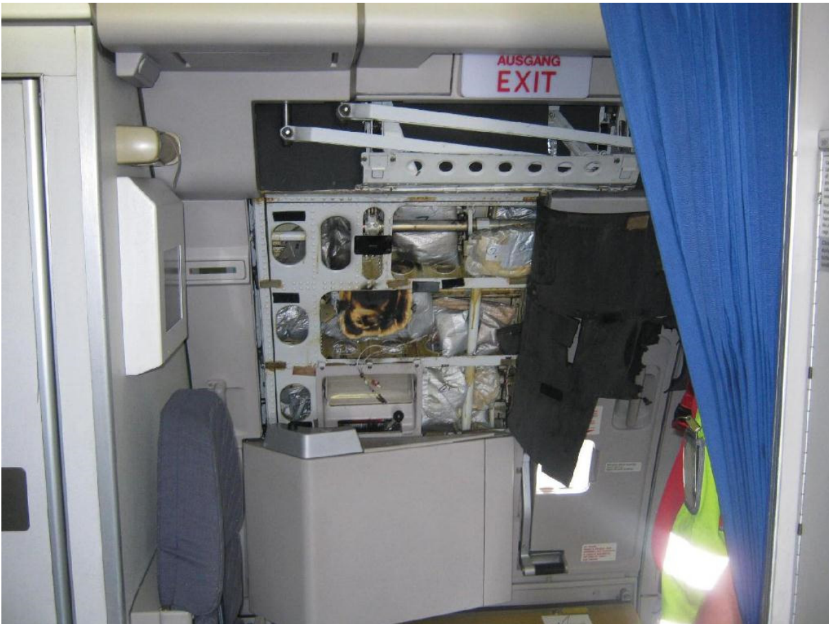
Fire area on door R2 after the panelling was removed