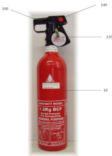
Fire extinguisher (example)