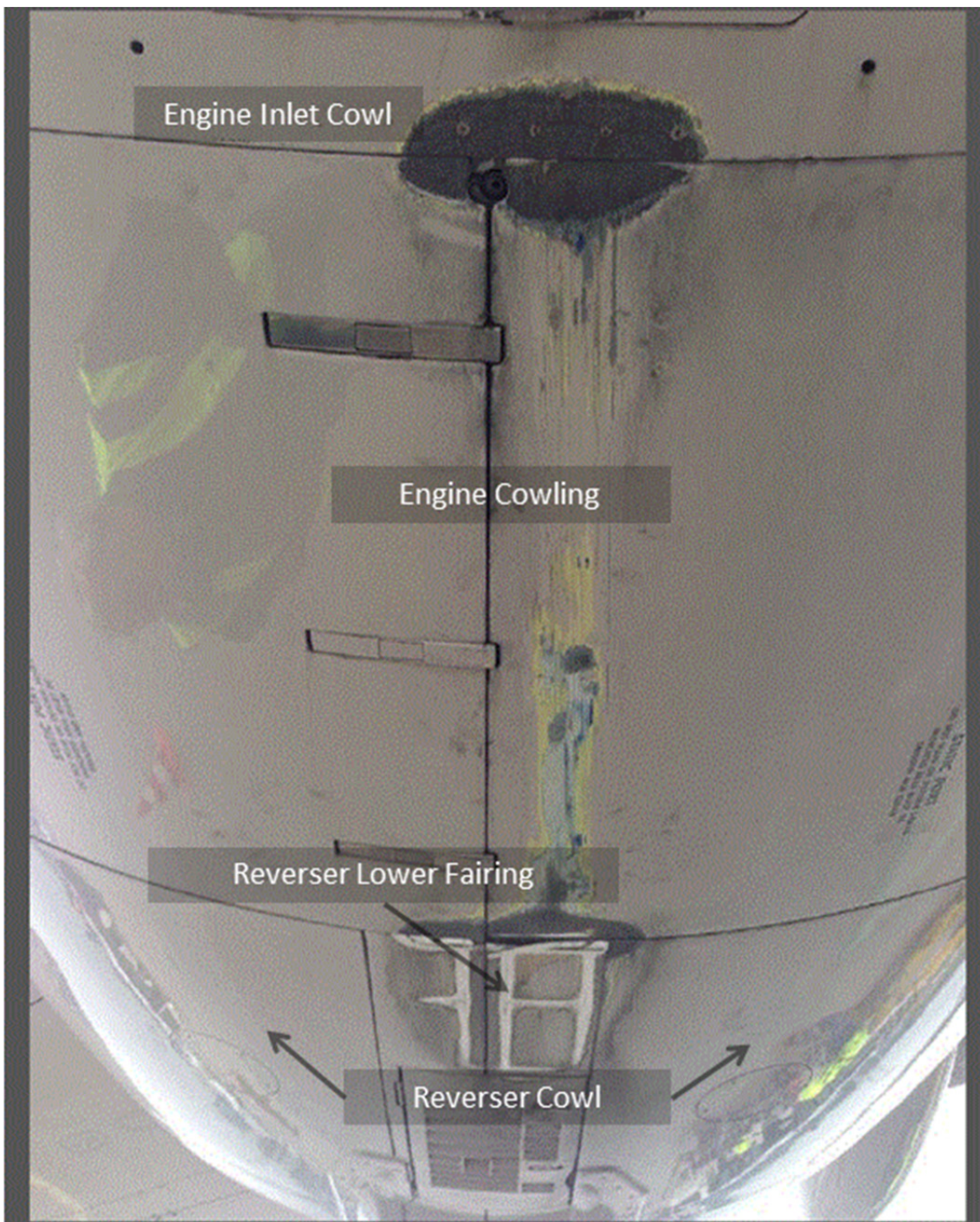
Lower surface of engine No 4