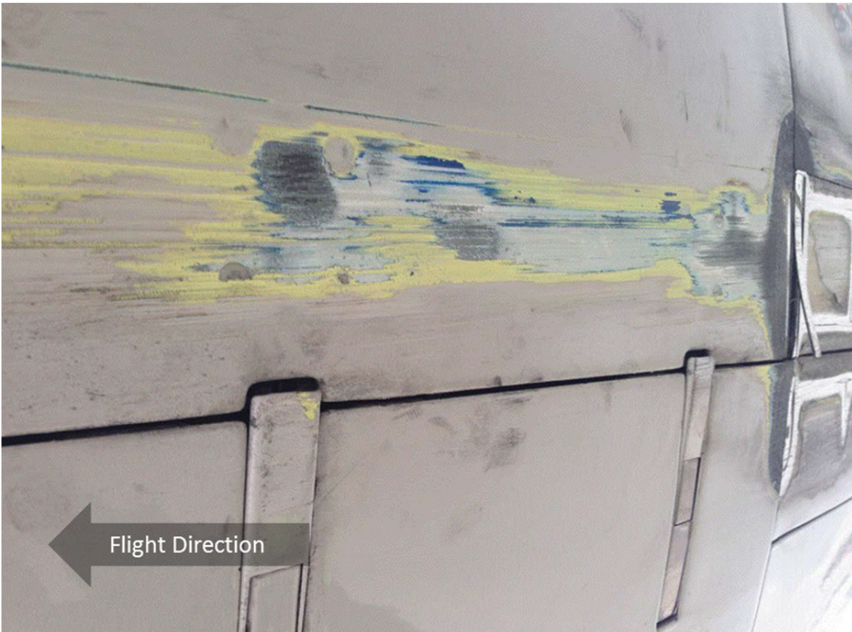
Damages on the lower engine cowling