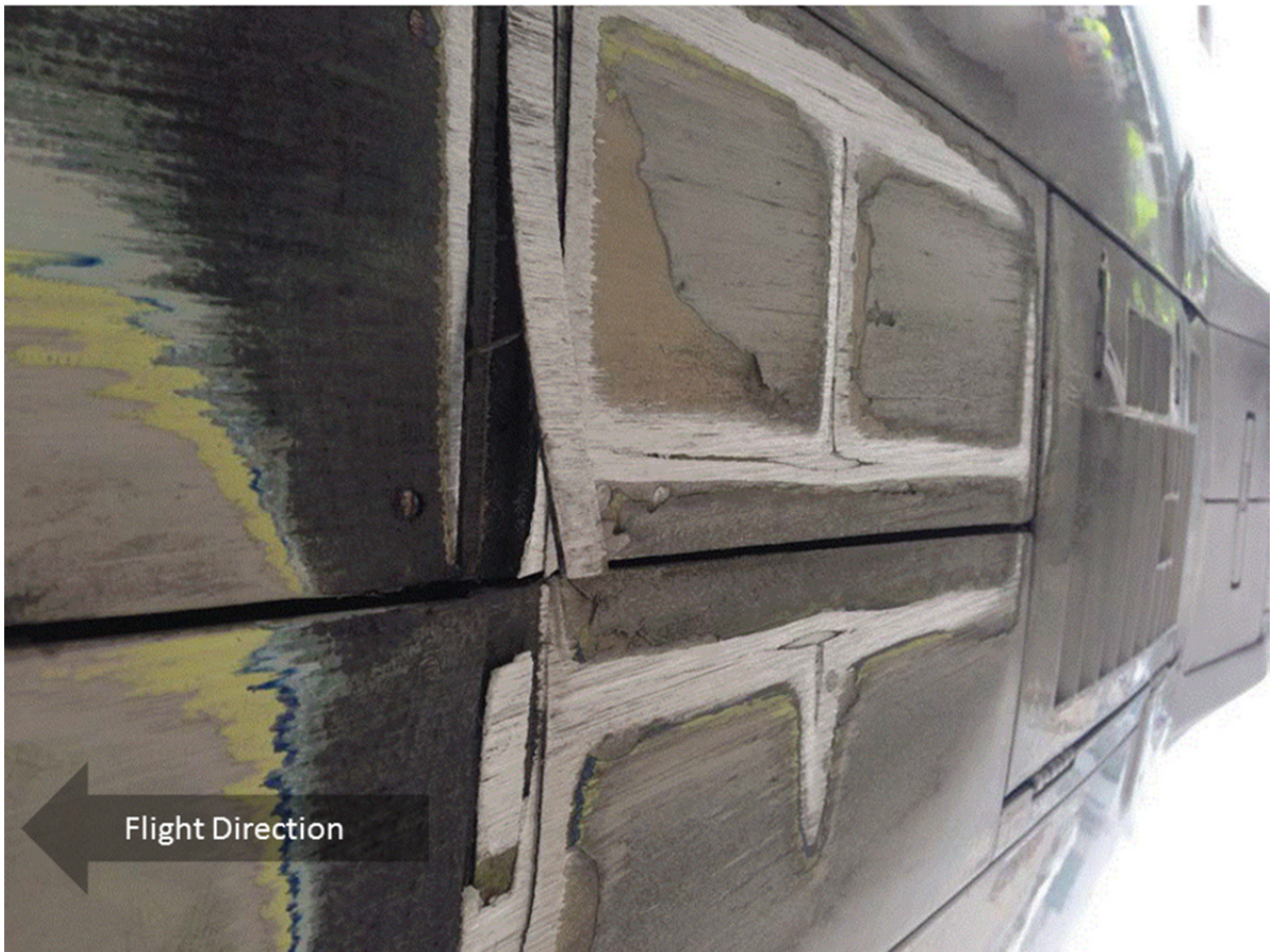
Damages on the reverser lower fairing