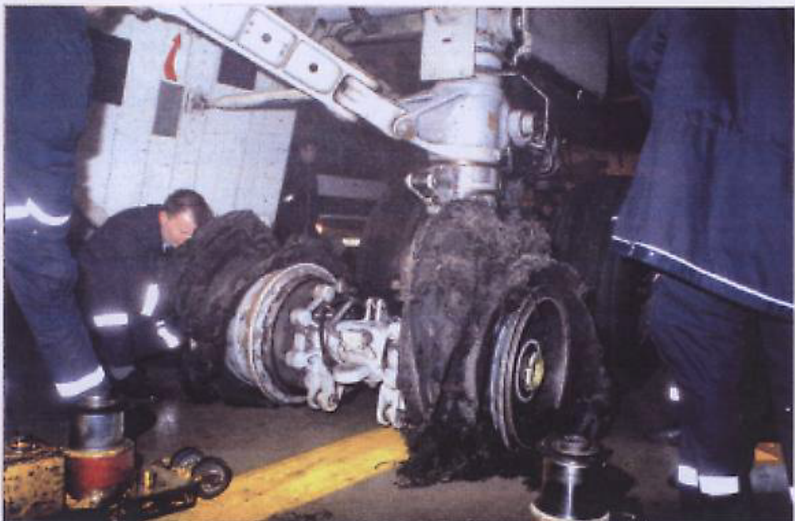
Details of L/H Body Gear, burned tires