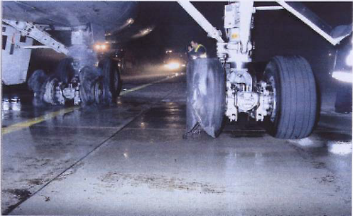
The damaged L/H Main Gear and L/H Body Gear