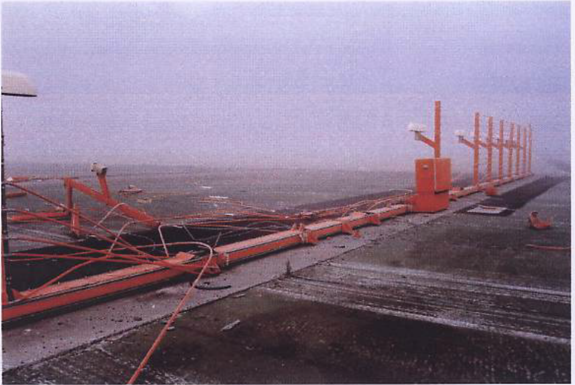
Destroyed localizer antenna of RWY 07R