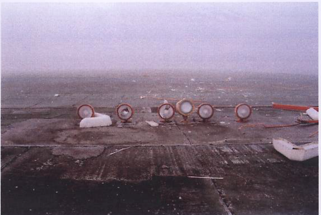
Parts of localizer antenna between the approach lights